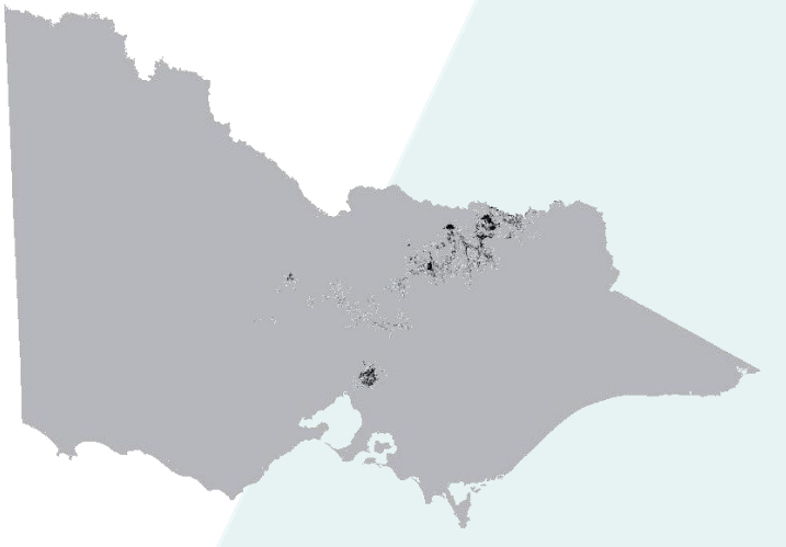
This habitat distribution model displays the indicative range of the Regent Honeyeater based on occurrence records and likely habitat. See <u>NatureKit</u> for an interactive map. The Regent Honeyeater also occurs outside of Victoria.