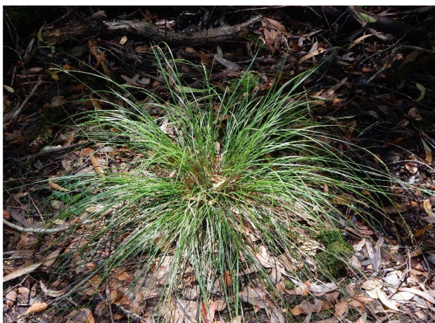
River Hook-sedge.