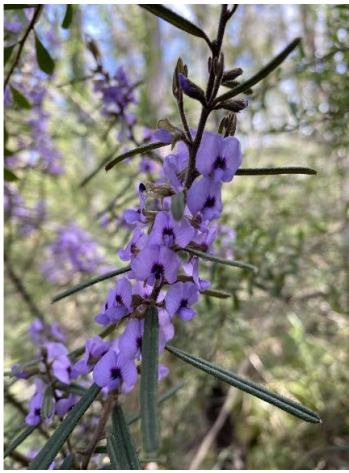
Rough Hovea.