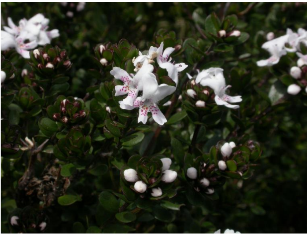
Shining Westringia.