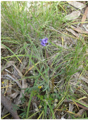
Silky Swainson-pea.