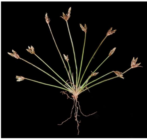
Slender Club-sedge. Image source: Atlas of Living Australia.