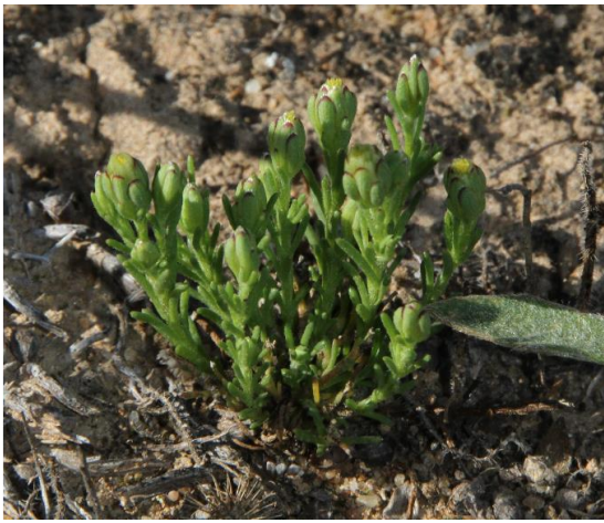
Small Elachanth.