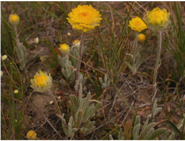
Soft Sunray.