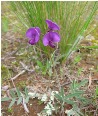
Southern Swainson-pea.