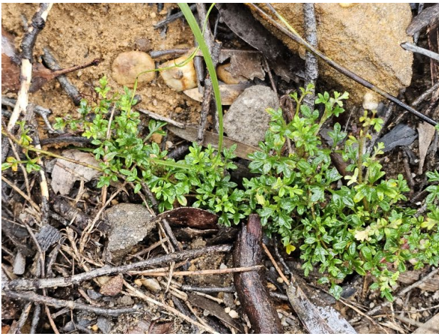
Star Xanthosia.