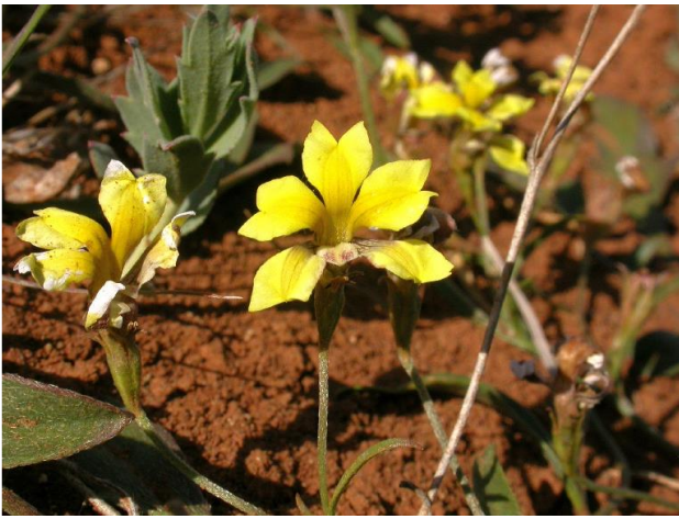
Stiff Goodenia.