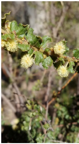
Timbertop Wattle.