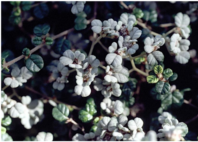
Tiny Spyridium.