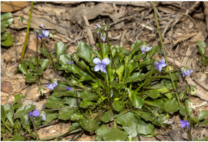
Tiny Violet.