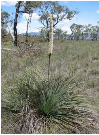
Tufted Grass-tree.