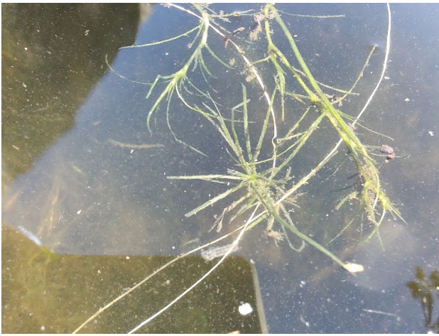
Water Nymph.