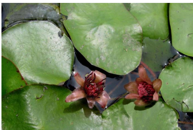
Water Shield.