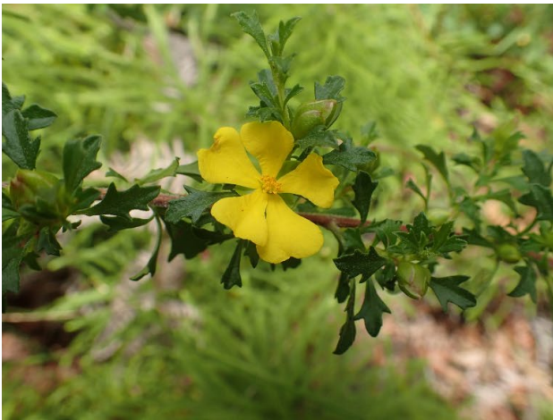
Wedge Guinea-flower.