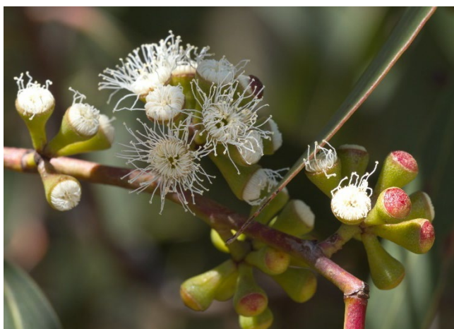
Western Peppermint.