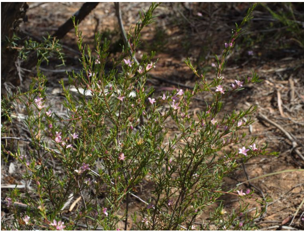
Whipstick Crowea.