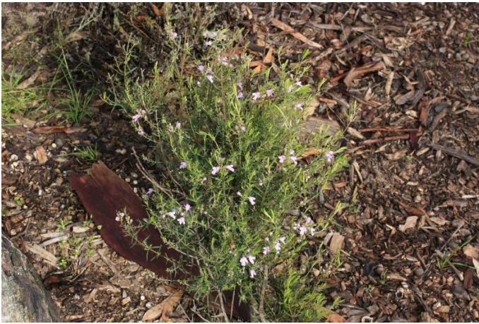
Whipstick Westringia.