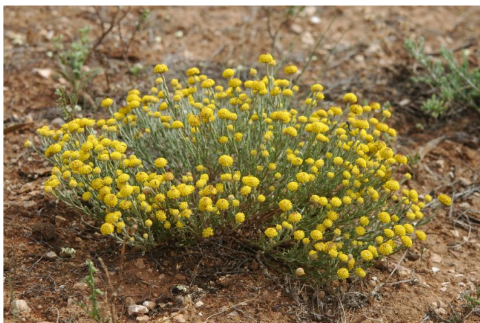
Woolly Yellow-heads.