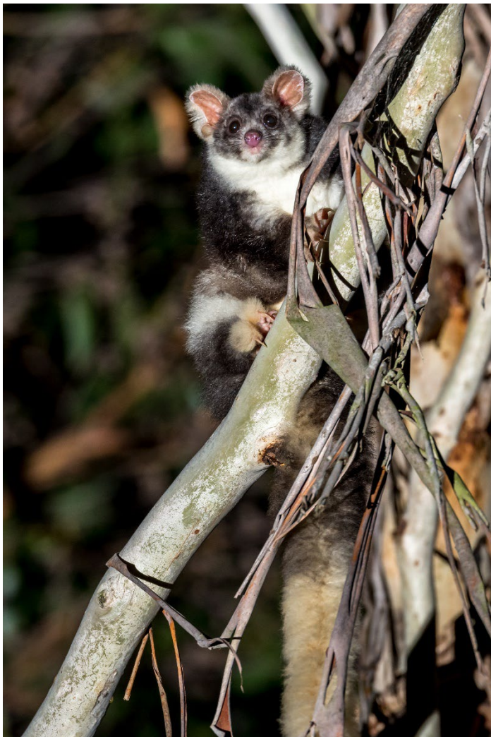
Petauroides volans (from Tallaganda NSW)

This document combines the approved conservation advice and listing assessment for the species. It provides a foundation for conservation action and further planning.